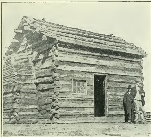
LINCOLN'S BIRTHPLACE, NEAR HODGENVILLE, KY.